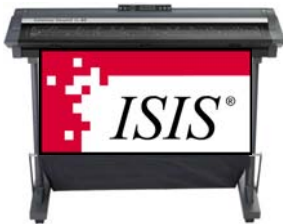
The only ISIS certified large format scanner, the SmartLF Ci 40.