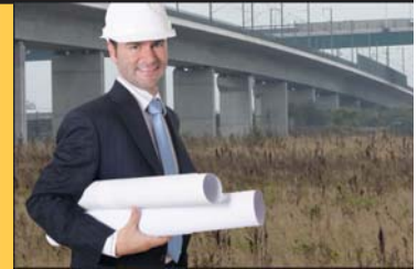
Quickly retrieve data