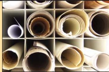
EDM, EDC and ECM applications