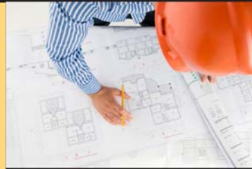
Technical documents on-site