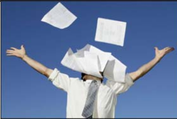
Large format ISIS support